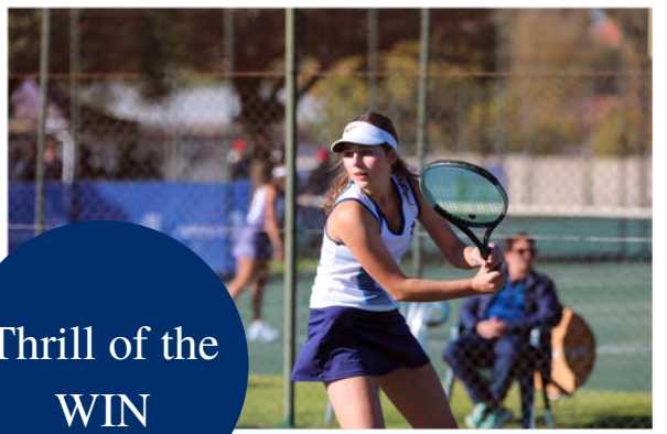
Thrill of the WIN